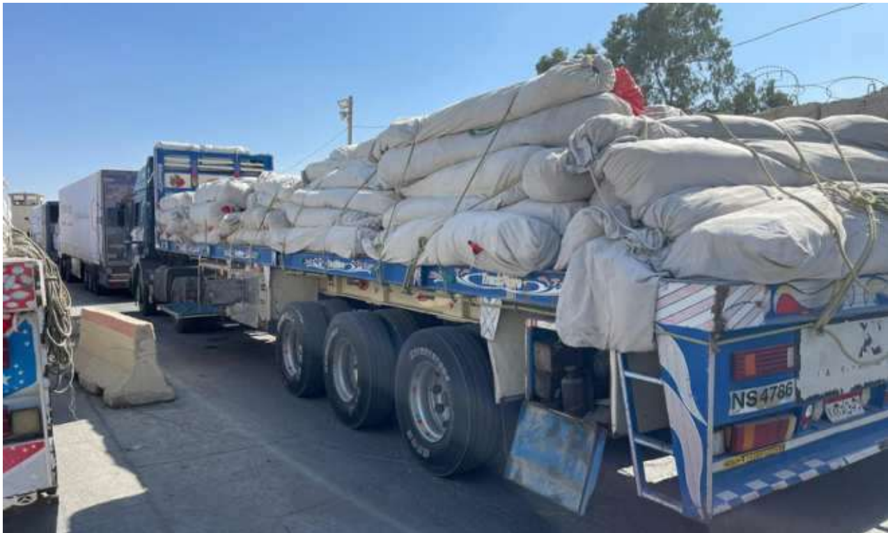
Trucks entering Rafah Crossing, carrying humanitarian aid, including food, medical supplies and water.

Throughout the period following the Hamas attacks, Israel has continued to allow inspected humanitarian aid to reach Gaza, including at least 700 trucks of supplies, through the Rafah crossing with Egypt, and in coordination with the United States, Egyptian authorities and the United Nations.