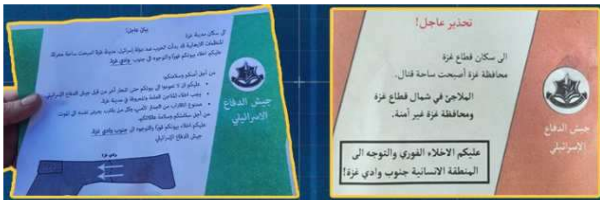
Letters from IDF to civilians in northern Gaza, suggesting to evacuate south

Throughout this campaign, Israel has issued repeated warnings for civilians in Gaza to evacuate defined areas, ahead of impending strikes. Many critics have charged that this amounts to 'forced displacement', which is a violation of international humanitarian law and a crime against humanity, pursuant to Article 7 of the Rome Statute . However, this is highly erroneous and a gross misinterpretation of both the law and Israel's intentions in providing such warnings.