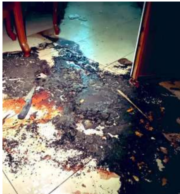
Bloodstained room in Kibbutz Be'eri, Southern Israel.

In short, what Hamas is carrying out is a triple war crime: using civilians in Gaza as human shields to attack civilians in Israel, while seeking the destruction of the Jewish state.